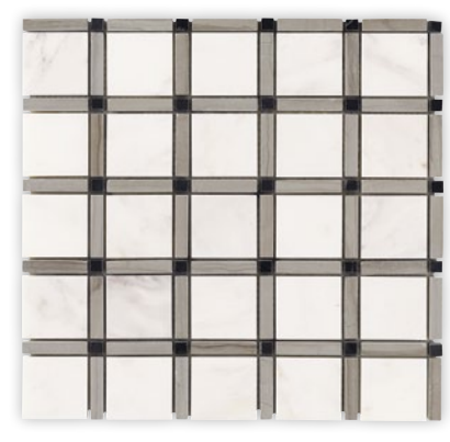
SLEEK B - 12" X 12" (30905)