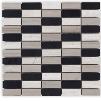
MODERNIQUE A - 12" X 12" (30909)

STREAM STONE MOSAICS ADD CONTEMPORARY FLAIR TO BACKSPLASHES, TUB ENCLOSURES, BATHROOM FLOORS, FIREPLACE FACADES, OR ANY DECORATIVE INTERIOR WALL OR FLOOR. THE PATTERN CHOICES STAY TRUE TO A CONTEMPORARY LIFESTYLE, CLEAN, UNEMBELLISHED, AND QUITE STYLISH. THE MOSAIC COLOR CHOICES COORDINATE PERFECTLY WITH THE FIELD TILES MAKING CHAPTER 3 VERY DESIGN FRIENDLY.