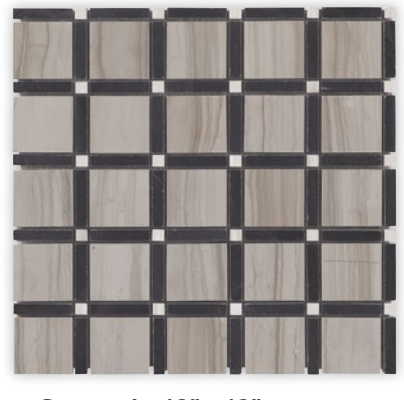
SLEEK A - 12" X 12" (30904)