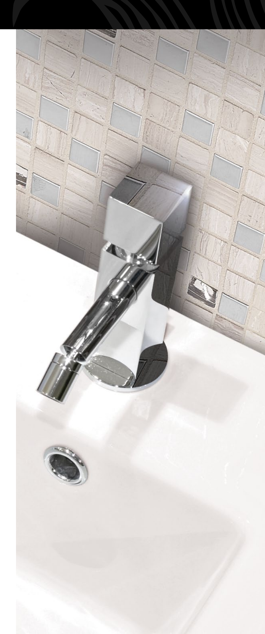
PLATINUM - 11<sup>3/4</sup>" X 11<sup>3/4</sup>" (30917) (STONE/GLASS /STAINLESS)

PICTURED: "PLATINUM" PATTERN 11^{3/4} X 11^{3/4} " GLASS, STONE, AND BRUSHED STAINLESS MOSAIC.