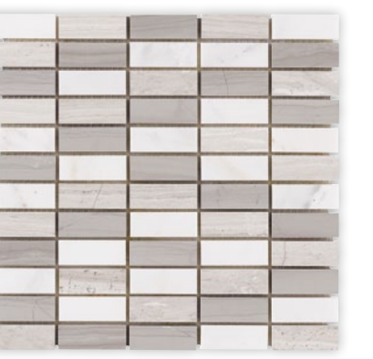
Modernique B - 12" x 12" (30910)