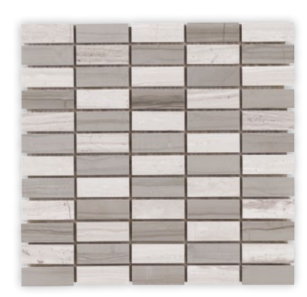
MODERNIQUE C - 12" X 12" (30911)