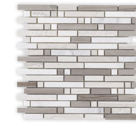
Моріян А - 12" x 12" (30907)