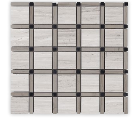
SLEEK C - 12" X 12" (30906)